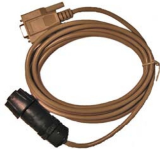
Serial Port Cable