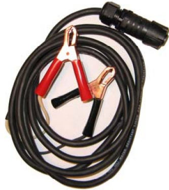
12 Volt Power Cable